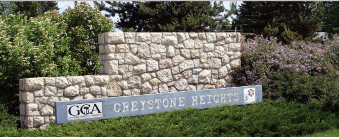
Photo Credit: Daryl Mitchell (2008) . Photo Modifications: scaled to fit. License: https://creativecommons.org/licenses/b