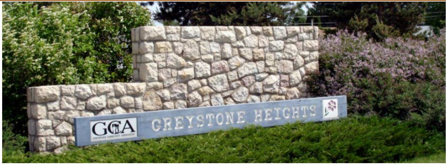
Photo Credit: Daryl Mitchell (2008). Photo Modifications: scaled to fit. License: https://creativecommons.org/licenses/by-sa/3.0/