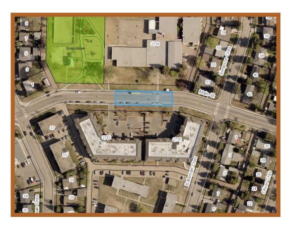
Part of main street will be closed during the event (shown above in blue)

Scan this QR code or visit www.thegreystone.ca to buy your tickets in advance!